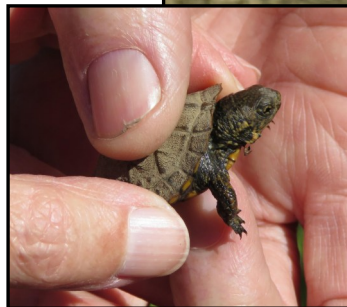
Baby Western Pond Turtle at Blue Heron Trails in the Refuge

Fun facts: Western Pond Turtles can remain under water for 60 minutes or more. They hibernate in mud at the bottom of ponds for the winter. The mom takes about 10 hours to dig a nest for her eggs.